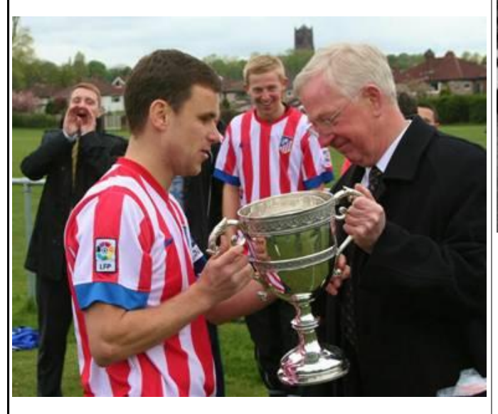
The team celebrate with the trophy