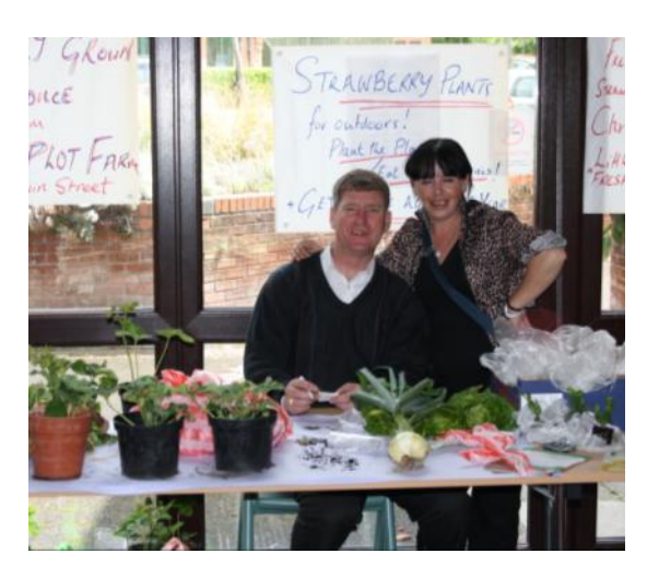
The plant, fruit and veg stall, all from Everton Park Growers group