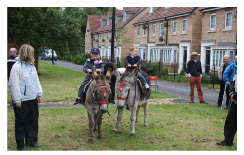
The popular donkeys in action