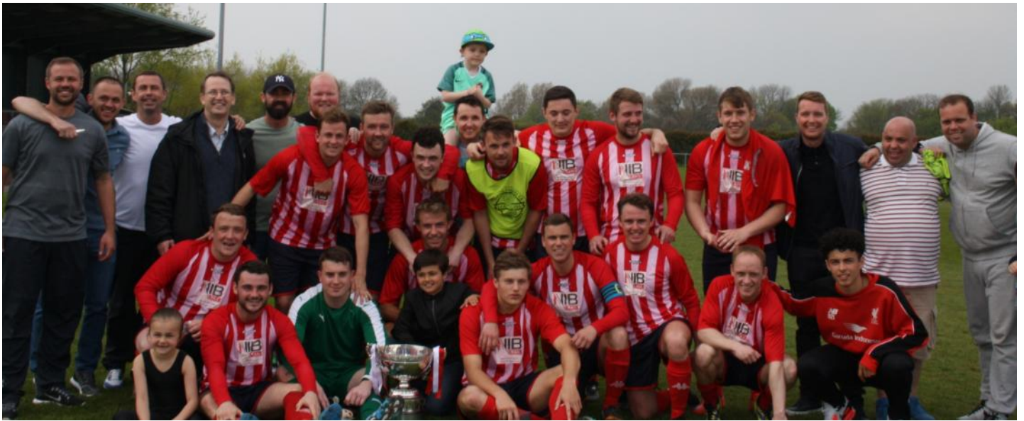
The West Everton Xaviers team pictured with the cup and with their supporters after the win

Our local football team West Everton Xaviers have won the George Mahon Cup after a fine 3-0 win over Old Xaverians. The Cup is one of the oldest trophies on Merseyside, and previous winners include Waterloo Dock, Aigburth People's Hall, Liverpool A and Everton A.