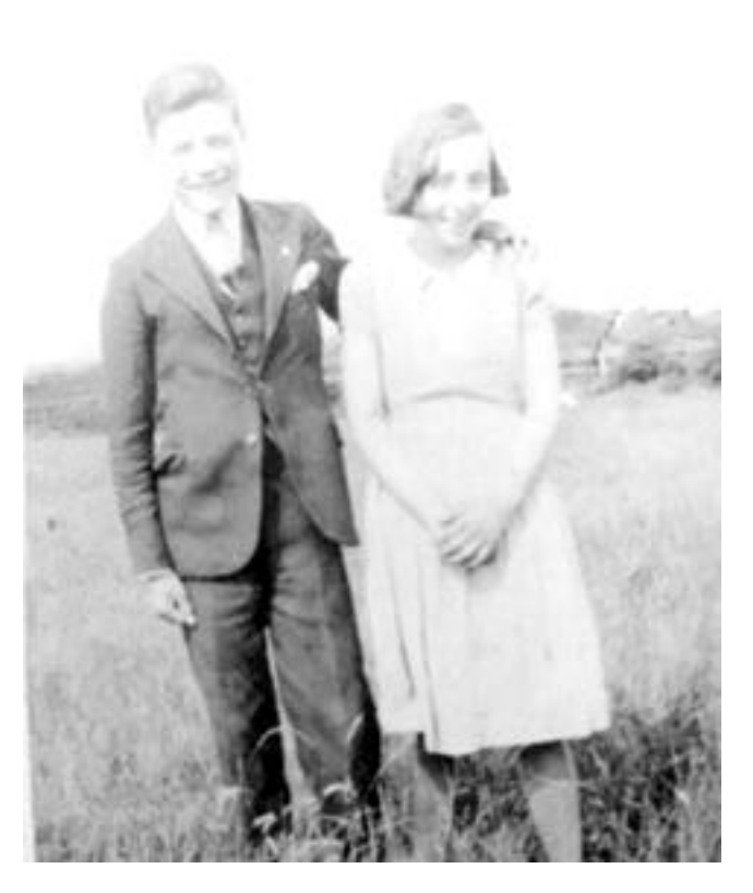
See below left

Recognise this loving couple, married in St Polycarp's Church on August 25th 1938, parents to 4 daughters, and then had 8 grandchildren, 7 great grandchildren, and 1 great great grandchild?