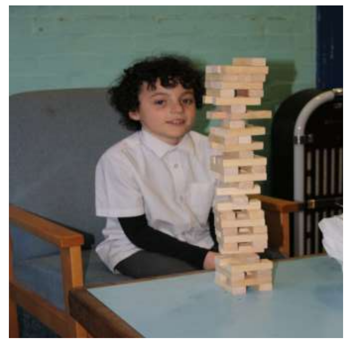
A Junior Club member with a 30 storey Jenga achievement

It is great to see so many young people benefiting from the service provided by a dedicated staff team and supported by a committed Board of Management. Since its inception 114 years ago, people and the relationships they form have been fundamental in creating a safe, caring, understanding and educational environment that benefits the community. This ethos continues to inform and guide our approach towards providing a quality service to over 200 members that the