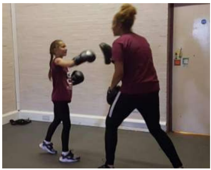
Sport at the Shewsy Summer Fair and at "This Girl Can". And below the "Big Get Together" Day with a game of bingo. Who wins? Everyone joining in 3 great community events in June.

Three very different but equally enjoyable community events happened on 3 Saturdays in June: on June 16th the Friends of Everton Park put on "This Girl Can" (see page 5), on June 23rd there was the Shewsy Summer Fair (see page 4) and on June 30th West Everton Community Council had their "Big Get Together" for the community (see page 5). All three events were about celebration and encouraging each other to make our community a happier, safer, fairer place. This Summer seems to be full of sporting events, with "winners", "losers" and