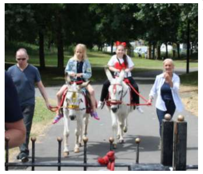
The donkeys working hard as ever