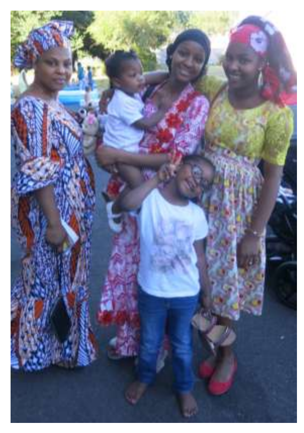
A happy group with all ages who enjoy WECC's hospitality