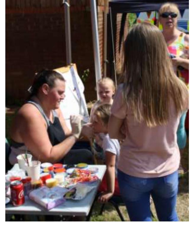
And a police dog keeping an eye (below)