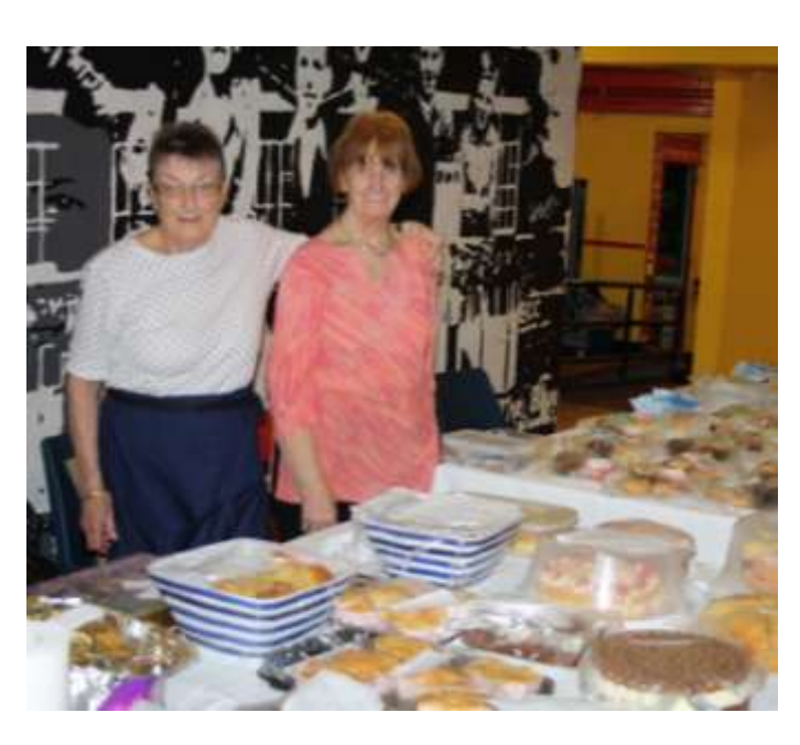
The joys of the cake stall