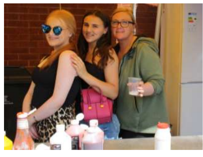
Great work on the bar-b-q (above) and the face-painting (below)