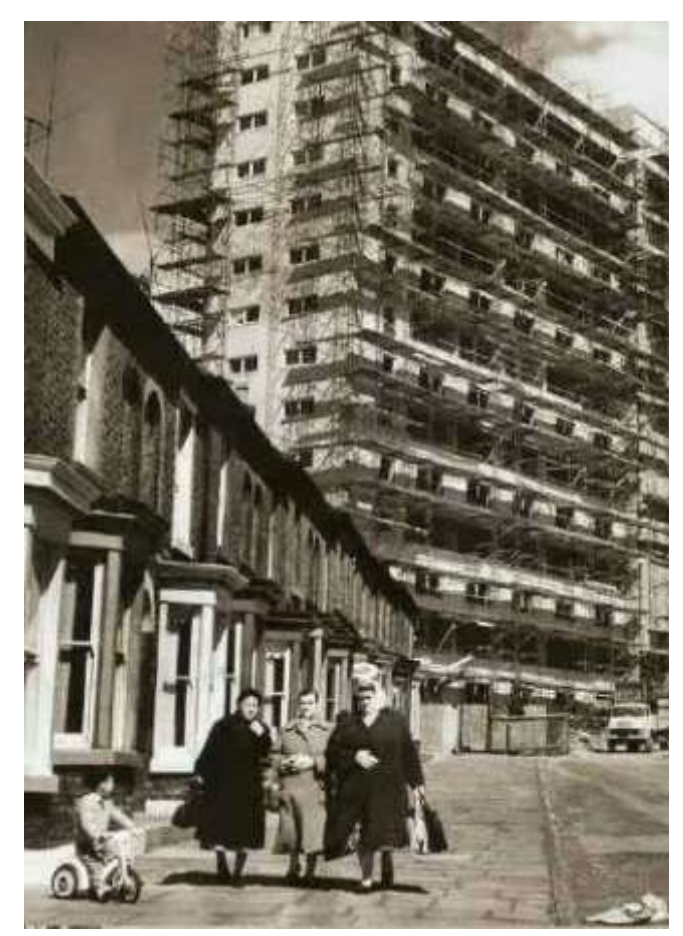
Ladies on the old Sackville Street which would become dominated by high rise blocks.

"Go online to <u>www.losttribeofeverton.com</u> to see some of the 342 streets already uploaded and awaiting your input. If your street or block of flats is not there, simply follow the onscreen instructions to put that right. Good collections are emerging of the likes of Netherfield Road, Great Homer Street, Everton Road, Heyworth Street, and Scottie Road, but we are just as interested in the smaller streets. Be the first to upload a picture or simply leave a written memory."