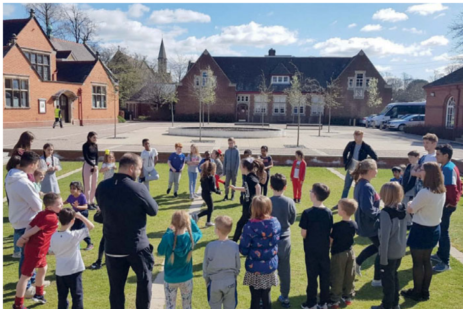
The Shrewsbury club's junior club visit to Shrewsbury School – June 2019