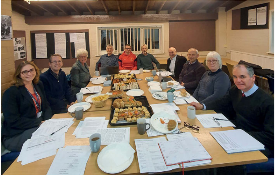
Our Board of Management at Shrewsbury House