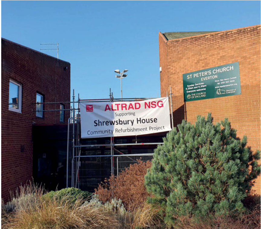
The gift of scaffolding ! Donated to help the club to re – roof much of the building

Our annual Away day is nearly upon us, this year hosted by Shrewsbury school and led by the headmaster. This was invaluable last year and we anticipate a repeat of that with our core staff and Board reviewing and planning our next phase of development.