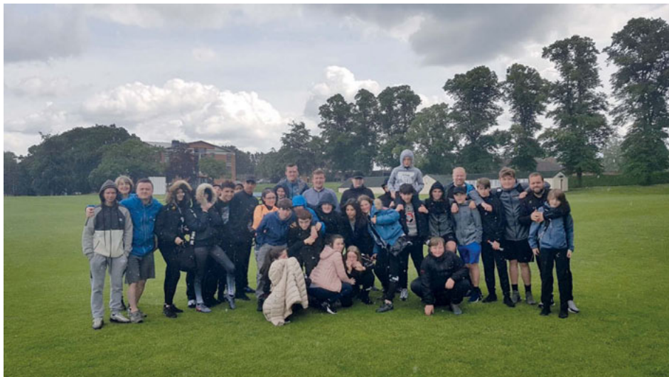
Club members enjoying a drop of drizzle on one of the increasing number of trips to Shrewsbury School