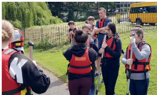
Club members prepare for a first ever canoe experience on the Severn